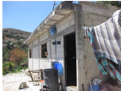
Figures 6, 7, 8. Different housing quality in San Andrés Azumiatla (Mundo, 2010).

Some people have no money to finish their houses, hence some constructions have the windows covered with paperboard or thick fabric because they do not have a window just the hole. This makes houses dark (around 35 lux when for carrying out simple tasks it is recommended at least an average of 100 lux) and cold during wintertime. Bad orientation also generates overheating and not enough daylight in people's homes.