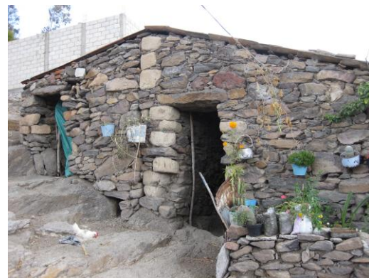
Figures 1, 2. Houses in San Andrés Azumiatla (Mundo, 2009).