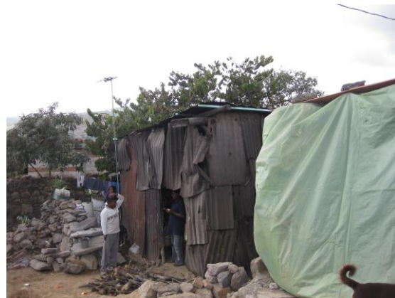
Figures 9 and 10. Poor quality housing in Azumiatla (Mundo, 2009).