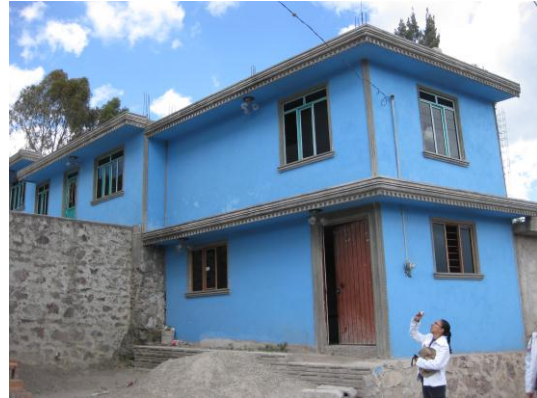
Figures 11 and 12. Housing influenced by the construction system used in the city (Mundo, 2009).