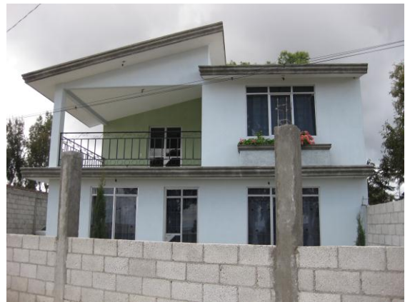
Figure 4 (Left). Vernacular house in Azumiatla. Figure 5 (right) Two storey new house in Azumiatla built with concrete bricks and steel (Polanco, Mundo, 2010).

Now, if we consider that vernacular architecture is part or product of the identity of a group of people, it is necessary to define the term Identity. Sosa (2010) has defined Identity according to three dimensions: the ethnic origin, a physical and geographical context and Idiosyncrasy as a product of social relationships that constitute a way of thinking and behaving, transforming the world with cultural and technical developments of a group of people. Hence,