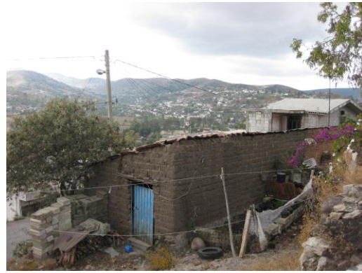
Figures 13 and 14. Vernacular architecture in San Andrés Azumiatla (Avila, Mundo, 2009).