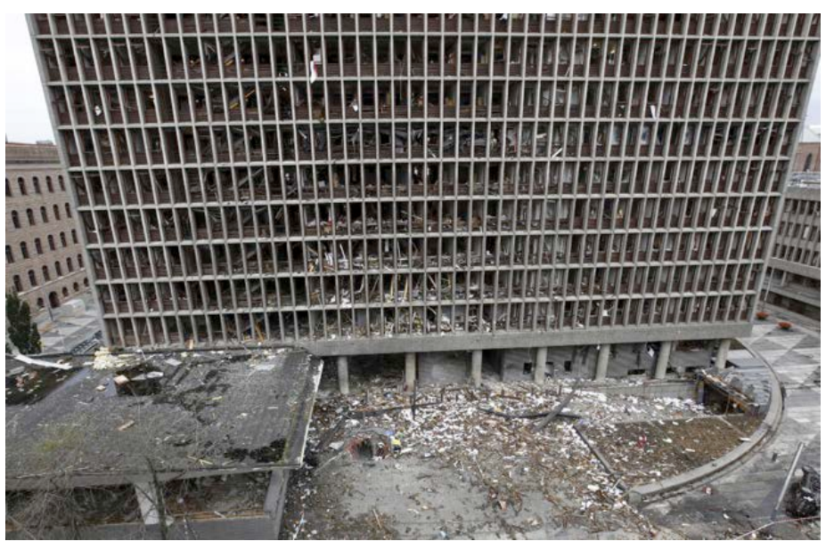
The H block of the Government Quarter after the bomb attack on July 22, 2011.

According to Breivik's ideology, the attack was meant to harm