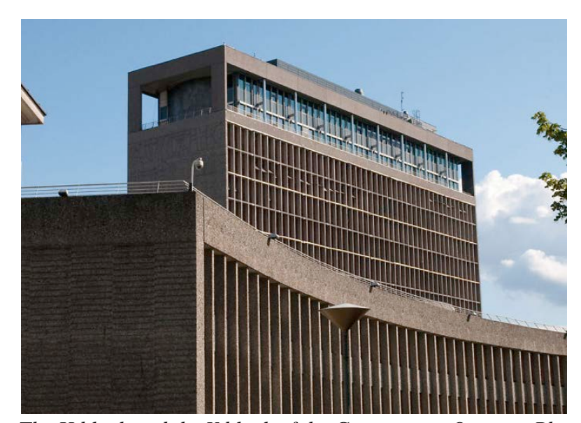
The H block and the Y block of the Government Quarter.